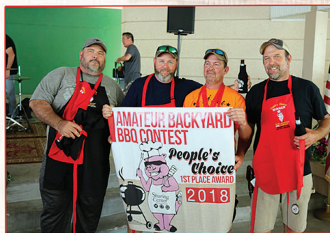
2018 People's Choice Winner

Currently seeking Amateur BBQ Contestants. For more information, contact us at BBQ@sharingcenter.org or 321-631-0306